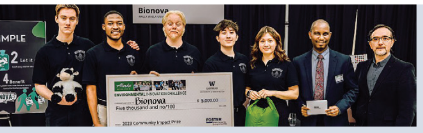
↑ Walla Walla University Enactus Club team poses with the Community Impact Prize they earned this spring for their energy innovation project Bionova, a biogas production process.